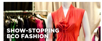
SHOW-STOPPING ECO FASHION