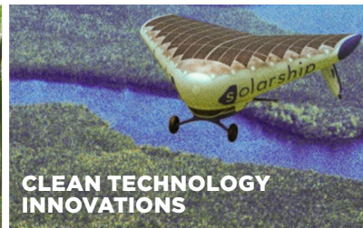
CLEAN TECHNOLOGY INNOVATIONS