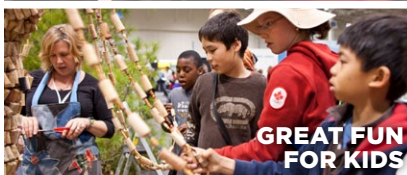
GREAT FUN FOR KIDS