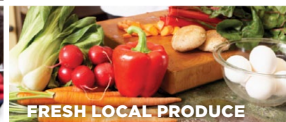
FRESH LOCAL PRODUCE