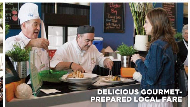
DELICIOUS GOURMET-PREPARED LOCAL FARE

FREE ADMISSION! Save yourself and a friend $15 each by printing these two tickets and bringing them to the show OR pass these along and get in FREE when you bring electronic waste to recycle courtesy of Samsung.