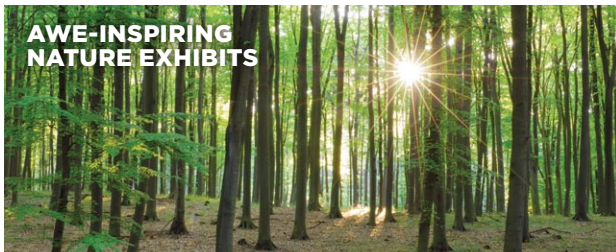
AWE-INSPIRING NATURE EXHIBITS

You're invited to Canada's largest consumer show dedicated to all things green.