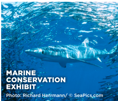
MARINE CONSERVATION EXHIBIT