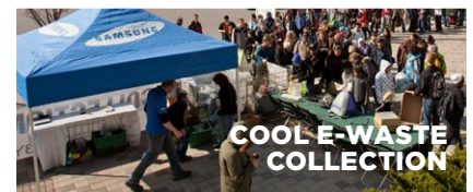
COOL E-WASTE COLLECTION