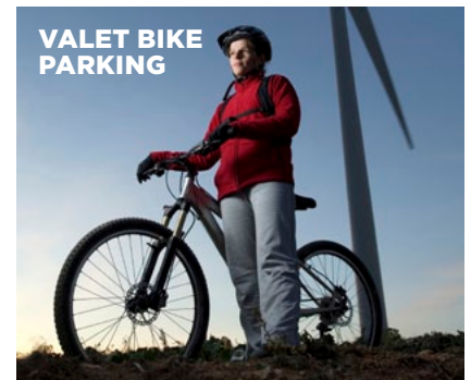
VALET BIKE PARKING

DIRECT ENERGY CENTRE, TORONTO GREENLIVINGSHOW.CA