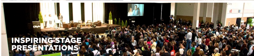
INSPIRING STAGE PRESENTATIONS